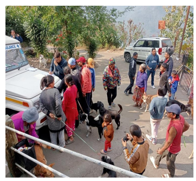
Anti-rabies drive at Bhalukhop and adjacent areas in Kalimpong