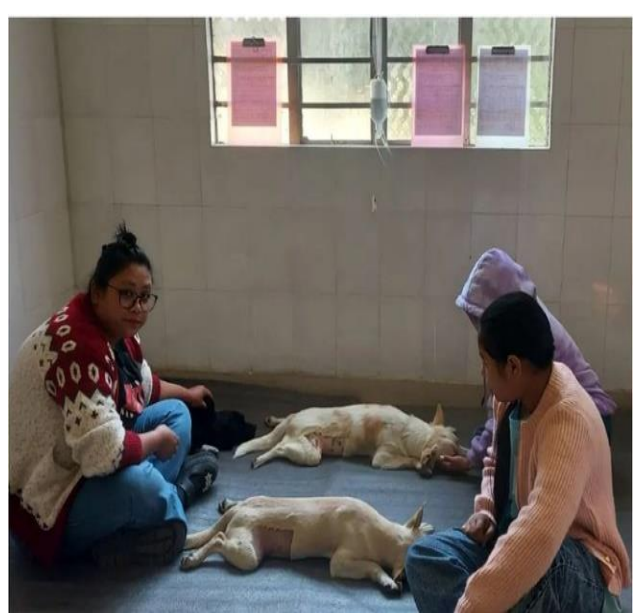
Fig below show the DAS Activity report for the month of January 2024