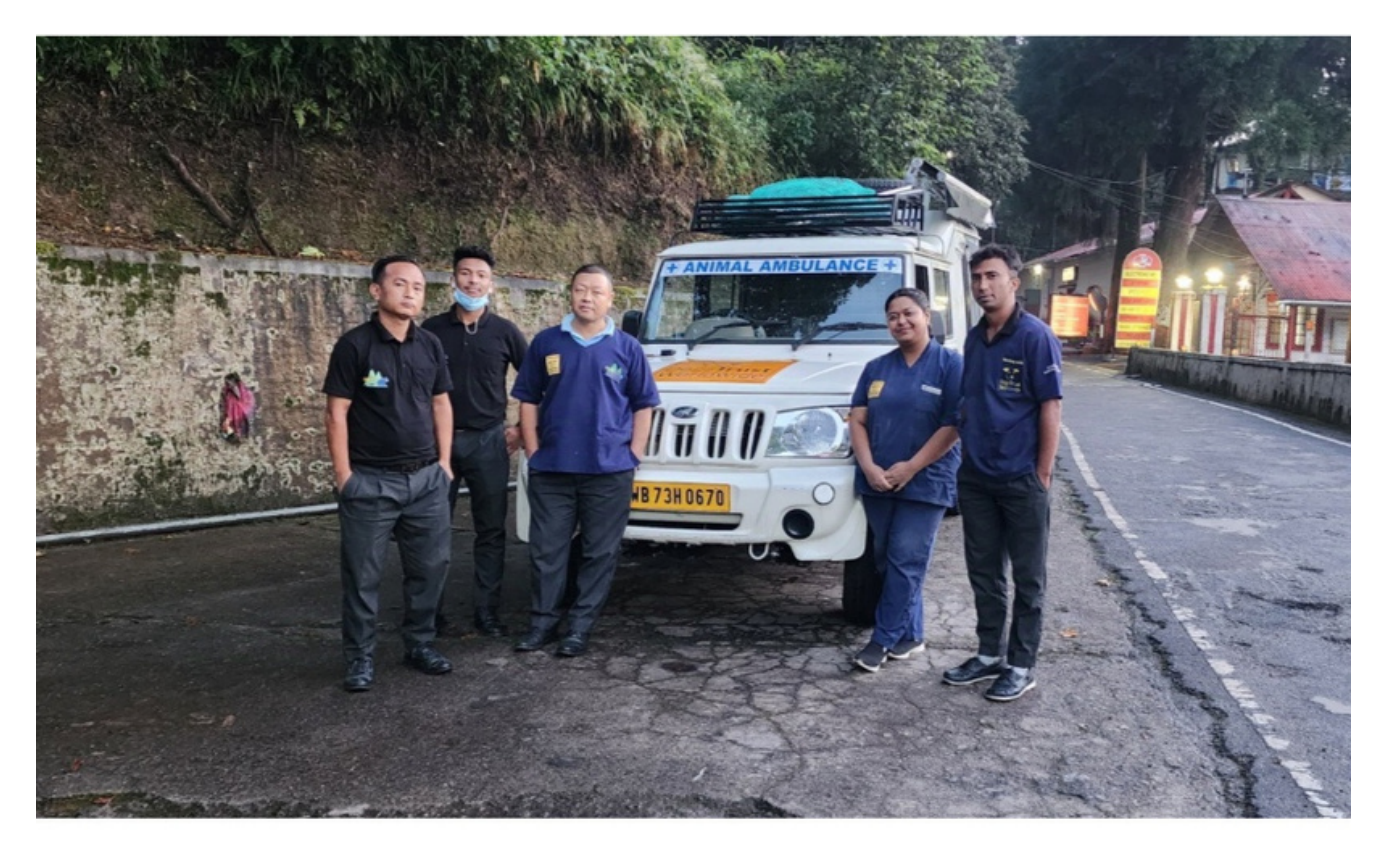
THE DAS TEAM AT JALAPAHAR CANTONMENT

Two Animal Birth Control (ABC) camps were held in Jalapahar Cantonment on September 5th and 6th, and in Limboo Busty, Tukvar, on September 7th and 8th. At the request of the current ADM commandant in Jalapahar, the ABC camp led to the sterilization of 8 dogs and 1 female cat, along with 13 rabies vaccinations. The sterilized dogs received post-operative care from the Jalapahar Cantonment team before being released the following day.