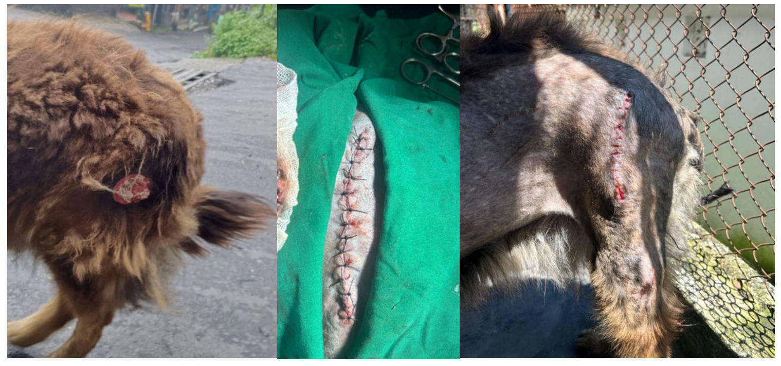
SECOND RESCUE CASE WITH TEMPORARY PARALYSIS IN THE HIND LEG