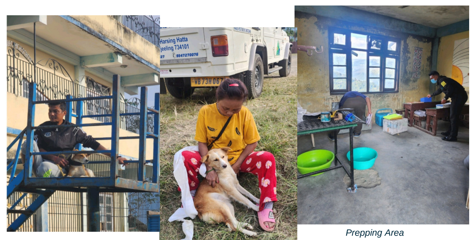
Thank you for your support