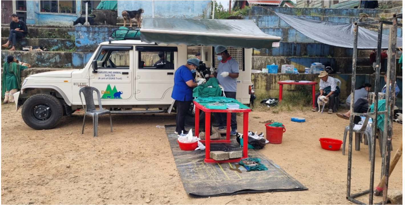
Relling ABC-ARV Camp