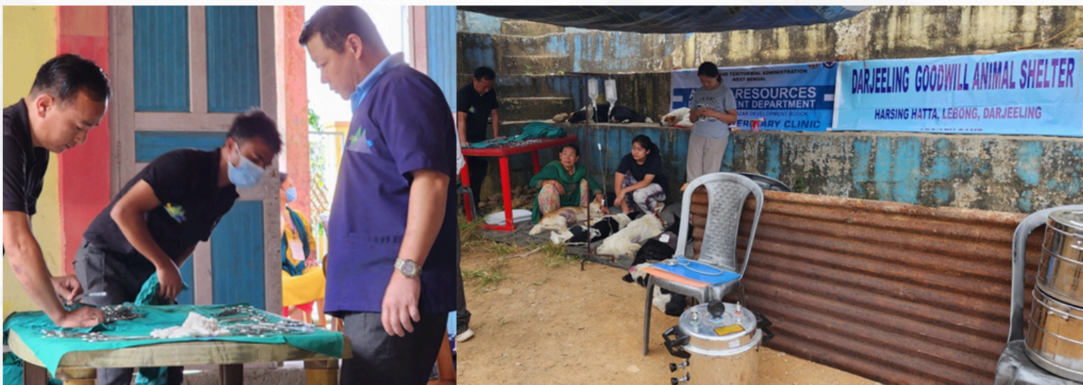
The DAS Team at camps

The second camp took place on October 24 at Relling, organized by Relling Gram Panchayat in collaboration with the Animal Resources Department (ARD) from Pul Bazar, Bijan Bari. Held in the open grounds of Relling Higher Secondary School, the team provided sterilizations for twenty-two dogs and vaccinated twenty-four dogs against rabies.